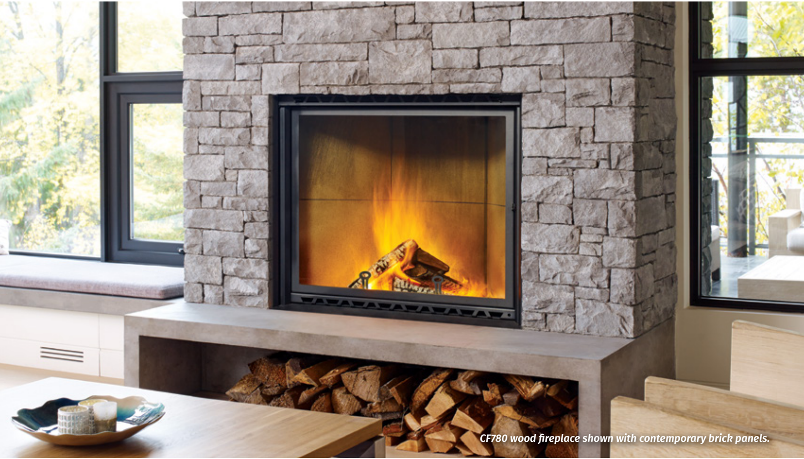
CF780 wood fireplace shown with contemporary brick panels.