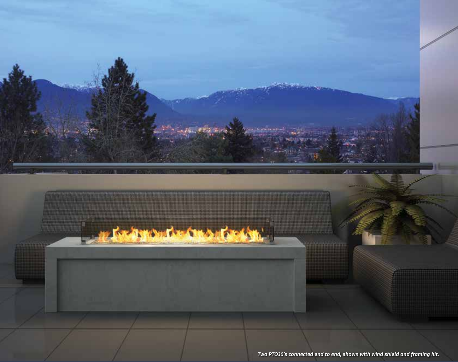
Two PTO30's connected end to end, shown with wind shield and framing kit.