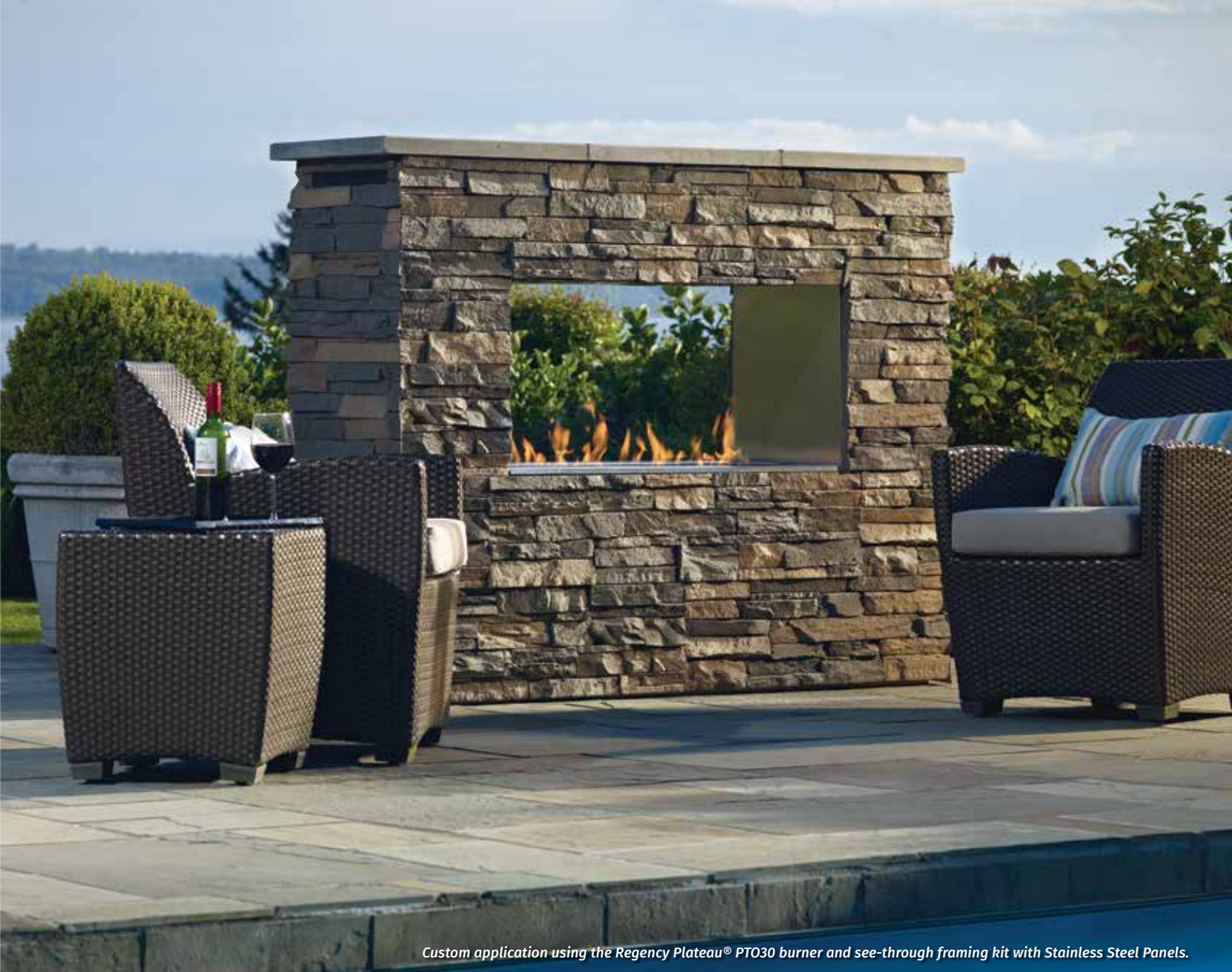
Custom application using the Regency Plateau® PTO30 burner and see-through framing kit with Stainless Steel Panels.